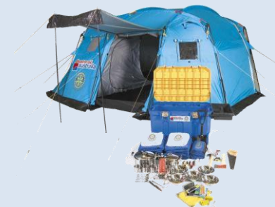
A DAA Family Survival Pack can help a disaster-affected family at a cost of just A$800